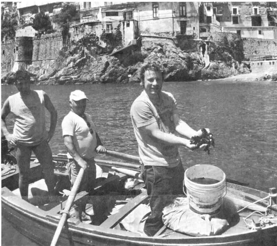
Musseling in: Jamie Oliver catches his own supper in the waters of the Mediterranean under the approving gaze of two Italian fishermen

Victorian-based Gourmet Tours flags its gastronomic focus and this extensive journey through three key Mediterranean islands takes in each island's regional cuisine as well as historic sights. The food focus will be on