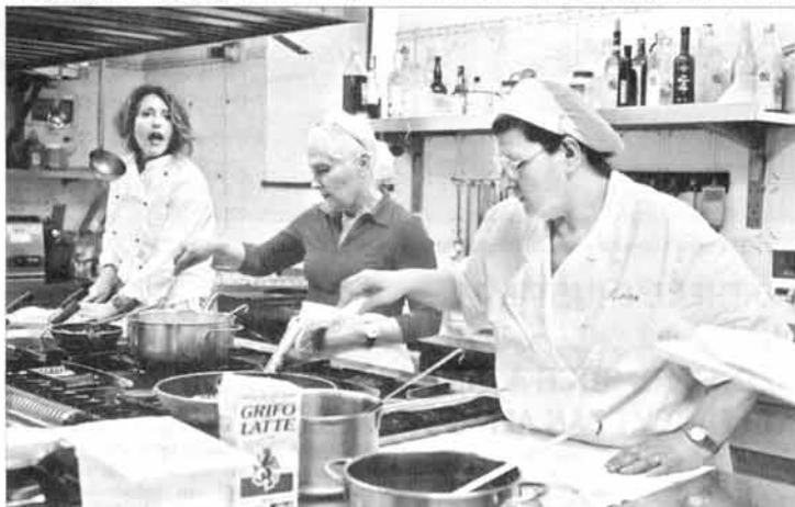
Pasta masters: Learning from the experts in an Umbrian kitchen

seafood and other specialties, including olive oil and varieties of wine. Wine tastings, meals and entry to locations are included in the cost. Guests can choose to travel to one, two or three islands. Price: $17,500 (land content only but includes the air fare between Sicily and Sardinia). Single islands from $5400. More: Howqua Dale Gourmet Tours, (03) 5777 3503; www.gtoa.com.au.